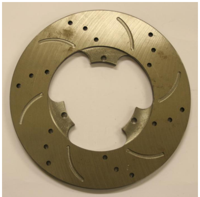
Photograph of brake disc