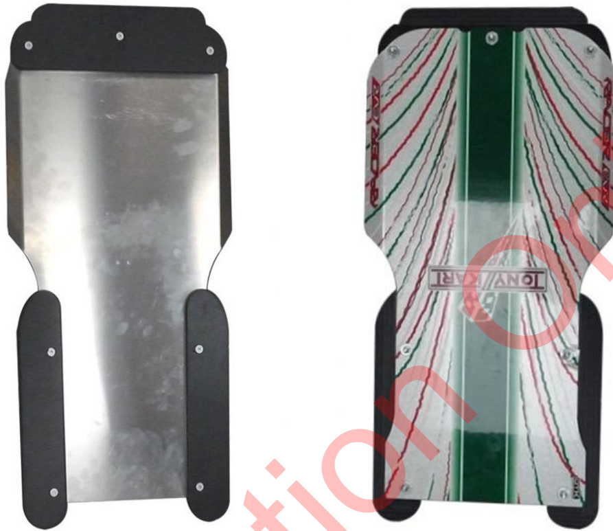
Photo of Chassis Protector Attached to Kart