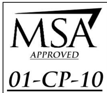
Image of Identification Marking