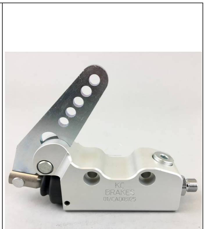
Photograph of master cylinder