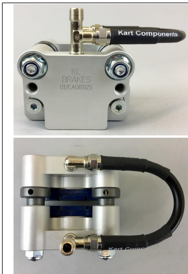
Photograph of brake calliper