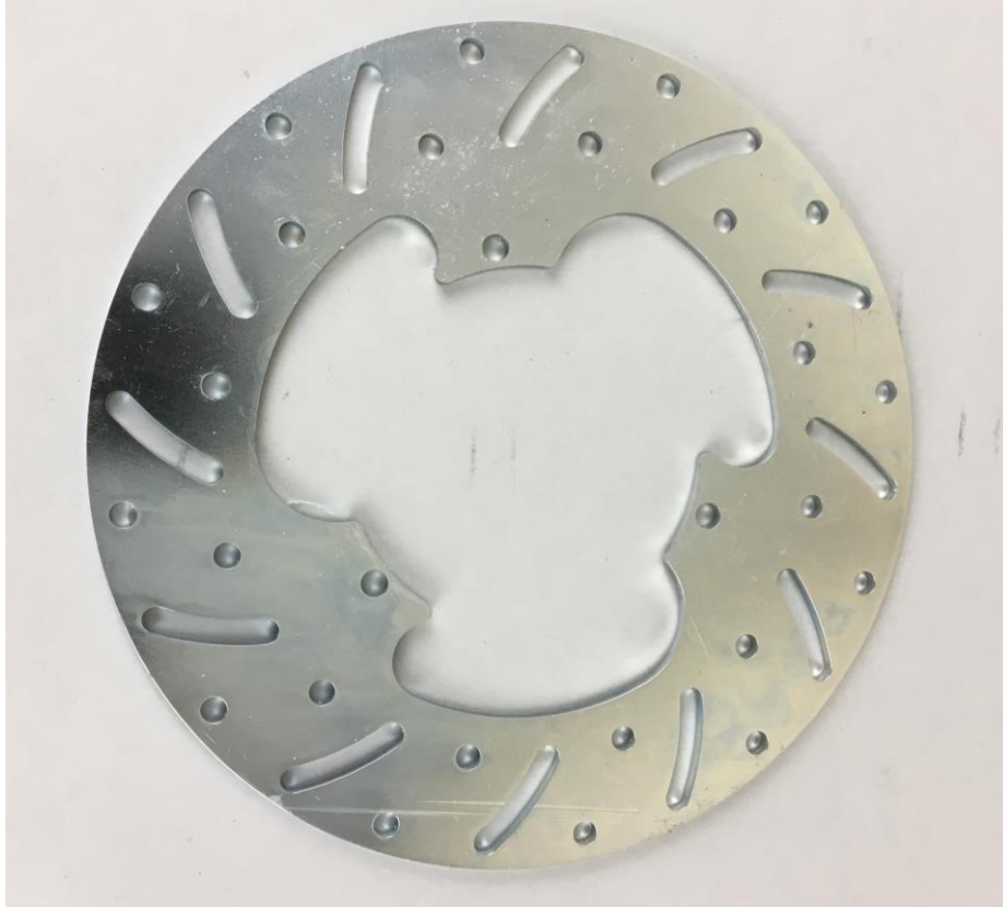
Photograph of brake disc