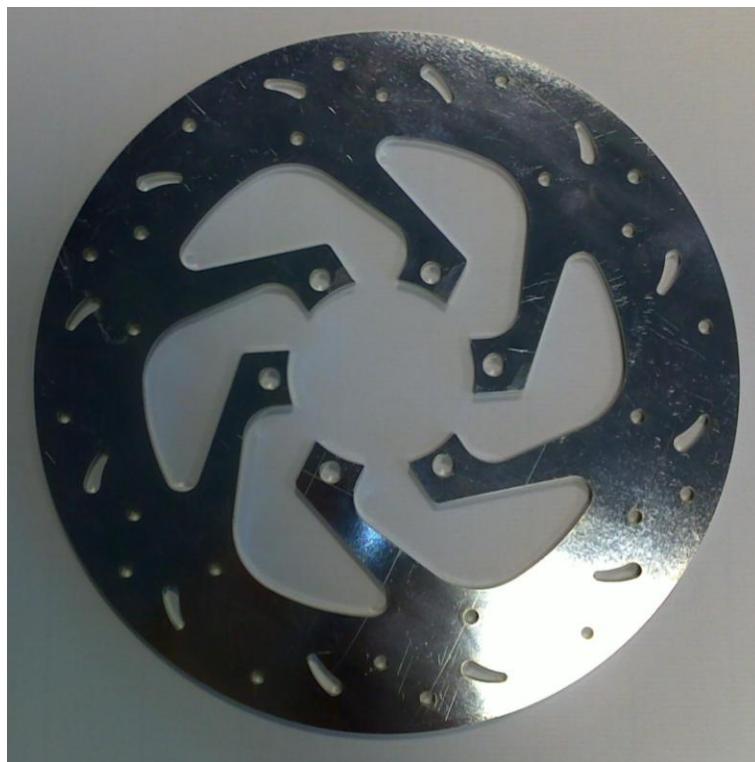
Photo of Brake Disc