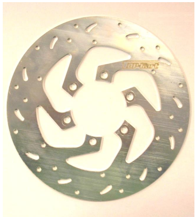
Photograph of brake disc