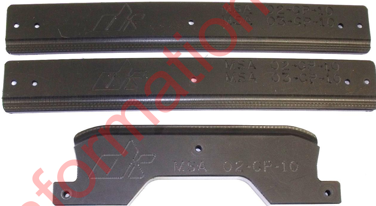
Photo of Chassis Protector

This Registration Form reproduces descriptions, illustrations and dimensions of the chassis protector at the moment of registration. This document may be supplemented by official amendment.