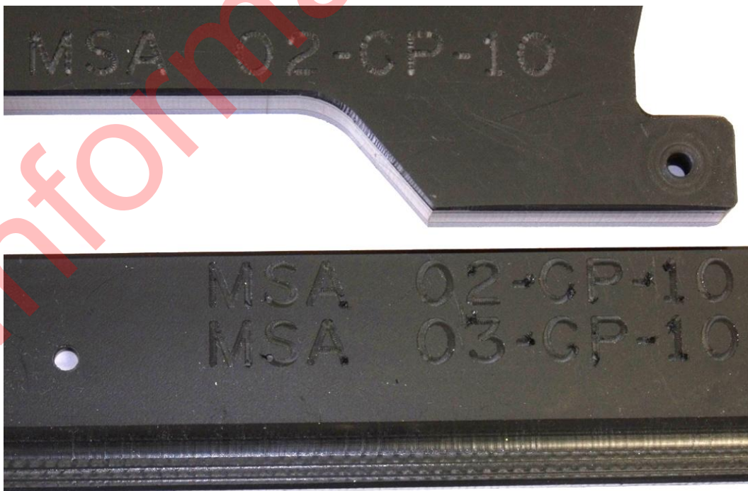
Image of Identification Marking