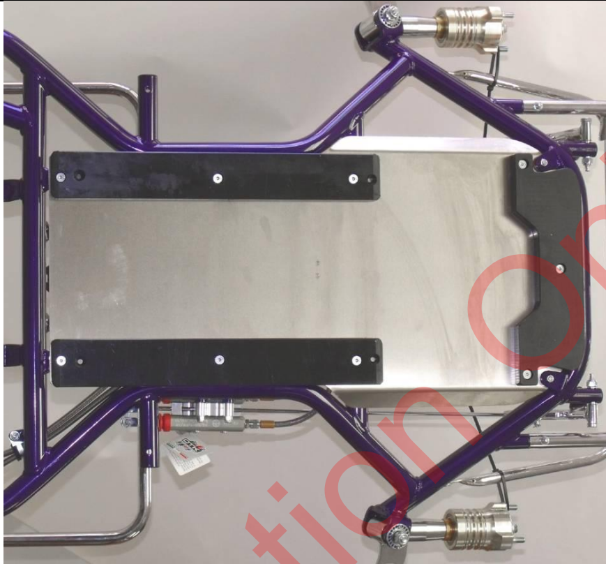
Photo of Chassis Protector Attached to Kart