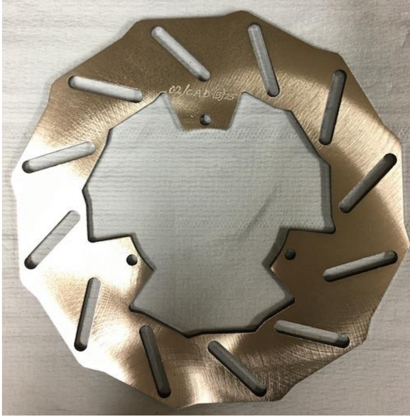
Photograph of brake disc