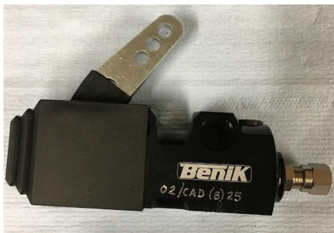
Photograph of master cylinder