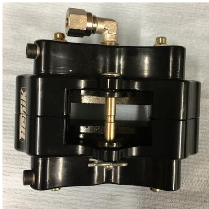
Photograph of brake calliper