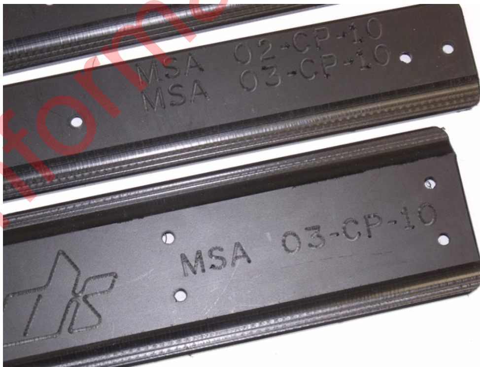
Image of Identification Marking