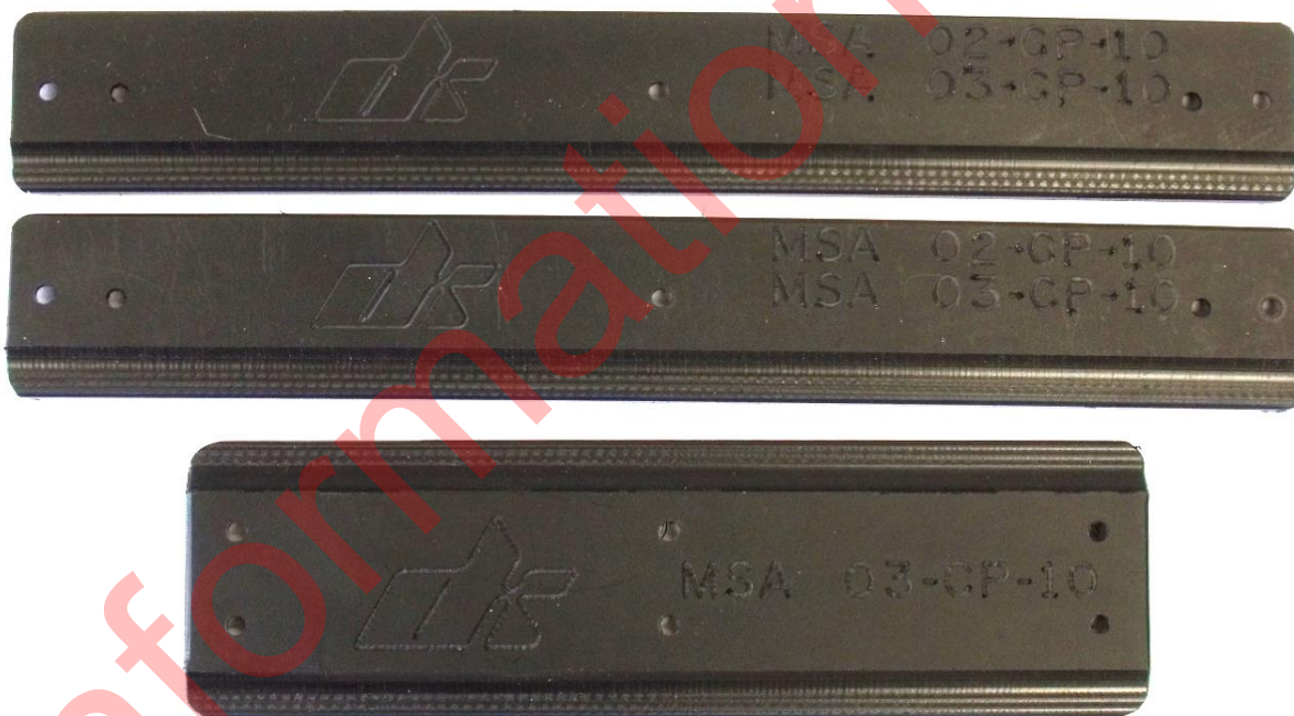
Photo of Chassis Protector

This Registration Form reproduces descriptions, illustrations and dimensions of the chassis protector at the moment of registration. This document may be supplemented by official amendment.