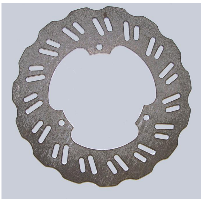
Photograph of brake disc