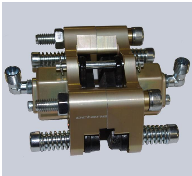
Photograph of brake caliper