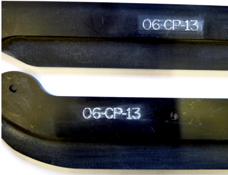
Image of Identification Marking