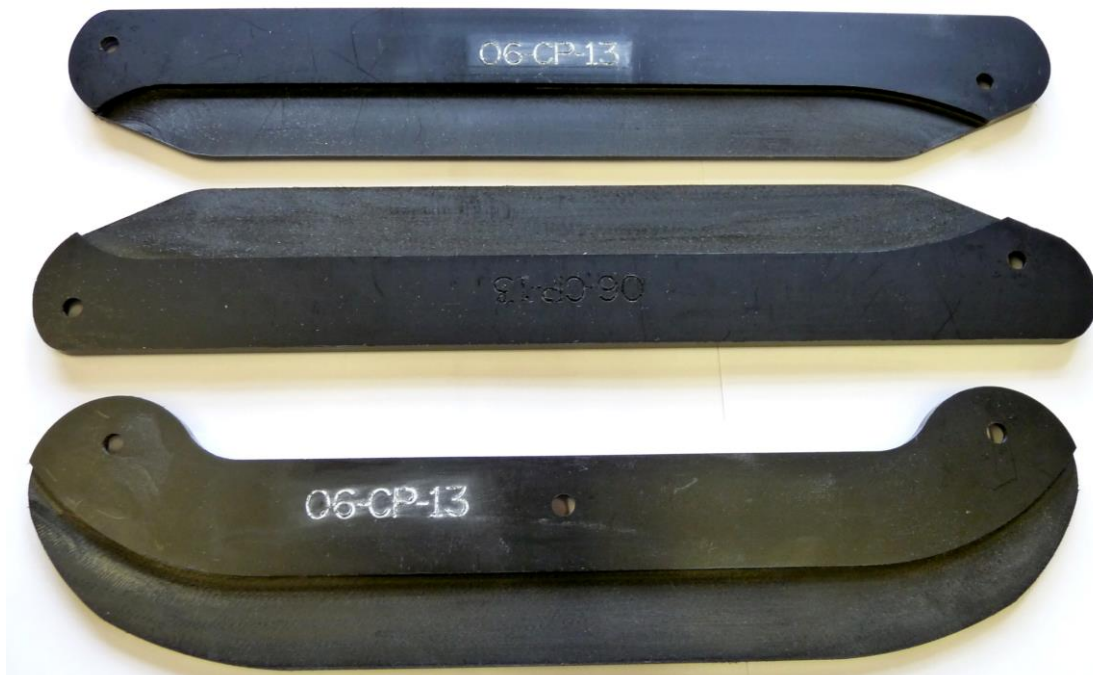
Photo of Chassis Protector

This Registration Form reproduces descriptions, illustrations and dimensions of the chassis protector at the moment of registration. This document may be supplemented by official amendment.