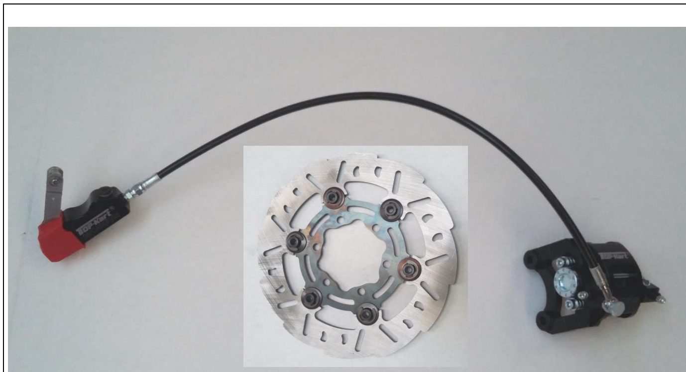
Photograph of the complete brake system

This Homologation Form reproduces descriptions, illustrations and dimensions of the brake system at the moment of the MSA homologation. The Manufacturer may modify them, but only within the limits set by the MSA Regulations in force and with the written agreement of the MSA.