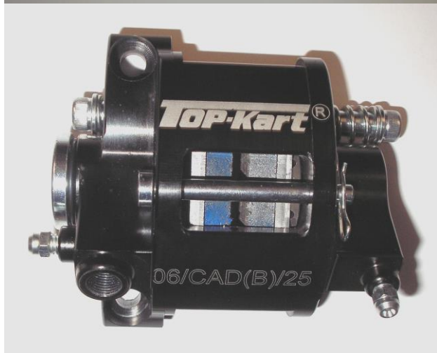
Photograph of brake calliper