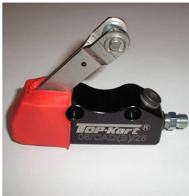
Photograph of master cylinder