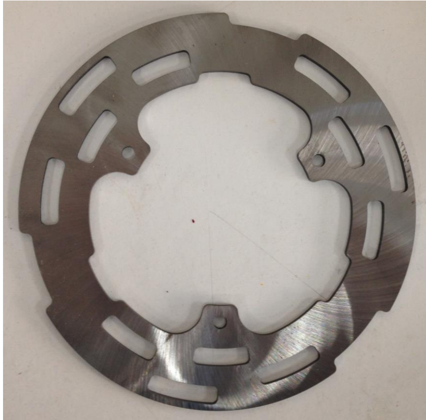
Photograph of brake disc