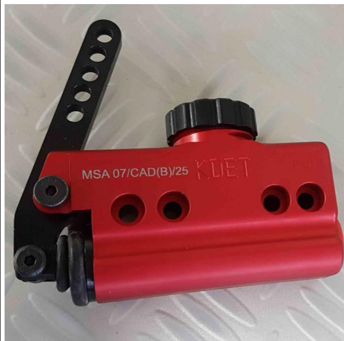
Photograph of master cylinder