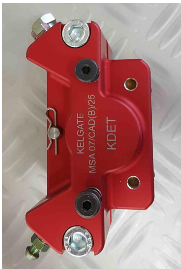
Photograph of brake calliper