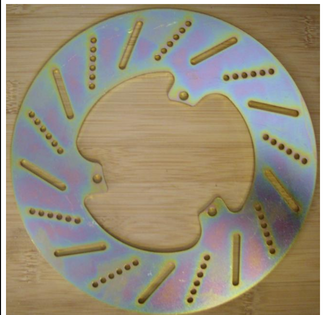
Photograph of brake disc