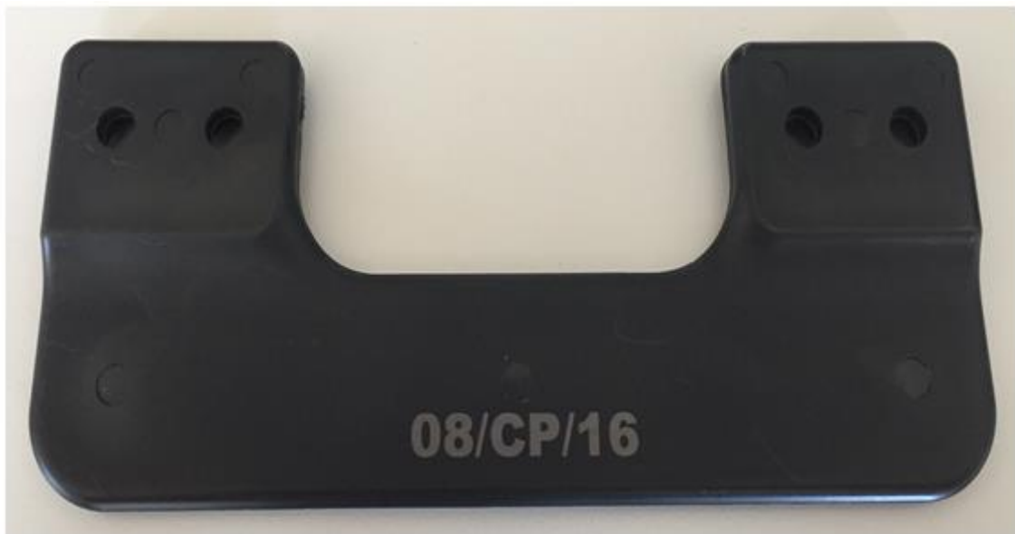
Image of Identification Marking