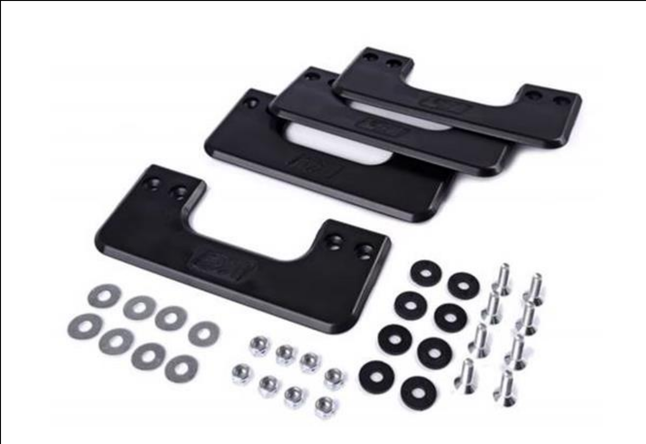
Photo of Chassis Protector

This Registration Form reproduces descriptions, illustrations and dimensions of the chassis protector at the moment of registration. This document may be supplemented by official amendment.