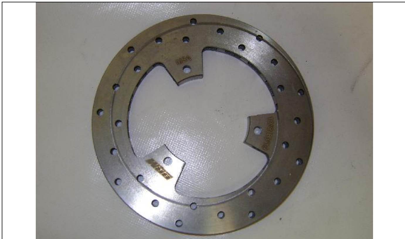
Photo of Brake Disc