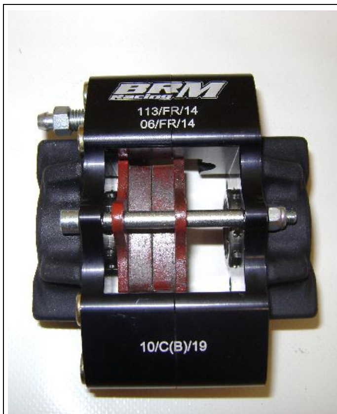
Photograph of brake caliper