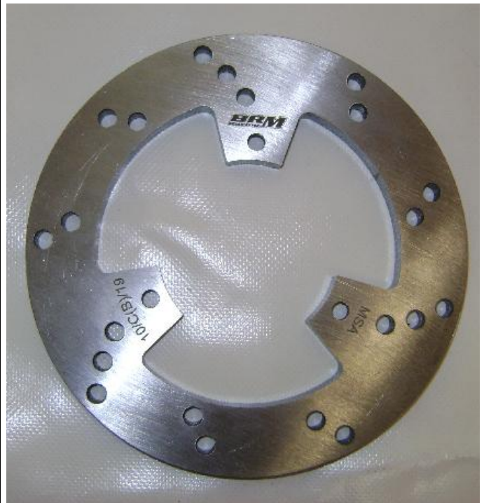
Photograph of brake disc