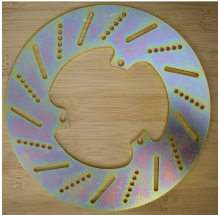
Photograph of brake disc