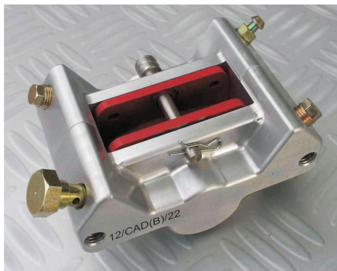
Photograph of brake calliper