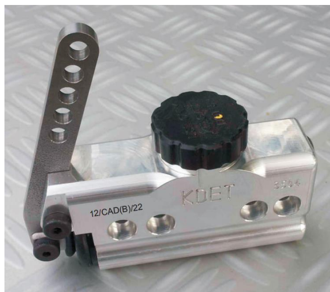
Photograph of master cylinder