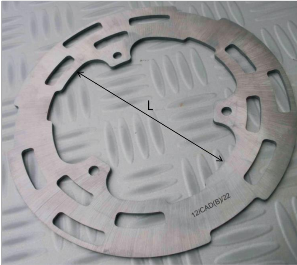
Photograph of brake disc