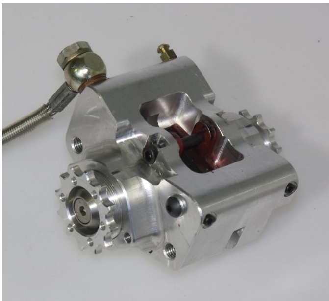
Photograph of brake caliper