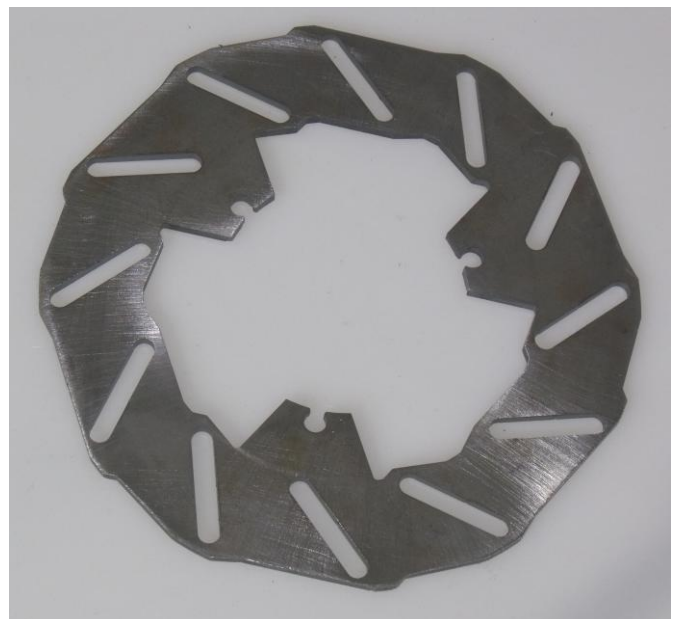
Photograph of brake disc