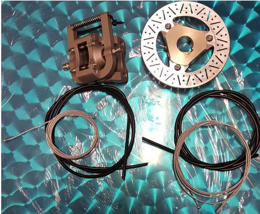
Photograph of complete brake system