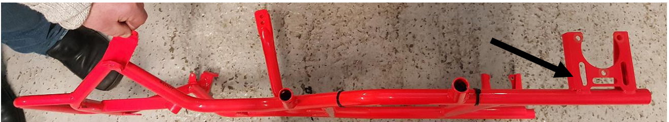
Photograph / drawing of position of I.D. plate