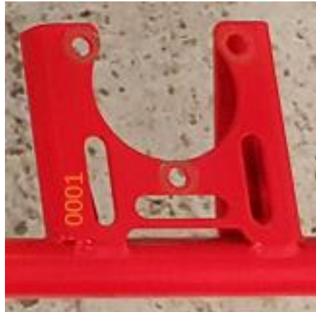
Photograph of I.D. plate