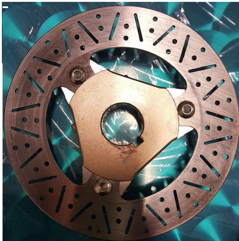
Photograph of brake disc