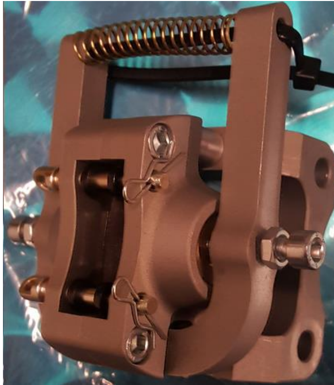
Photograph of brake caliper