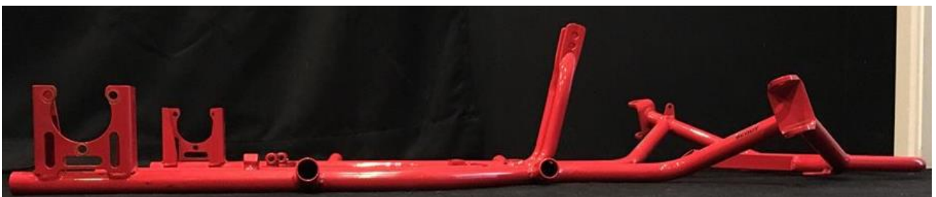
Side view of chassis frame