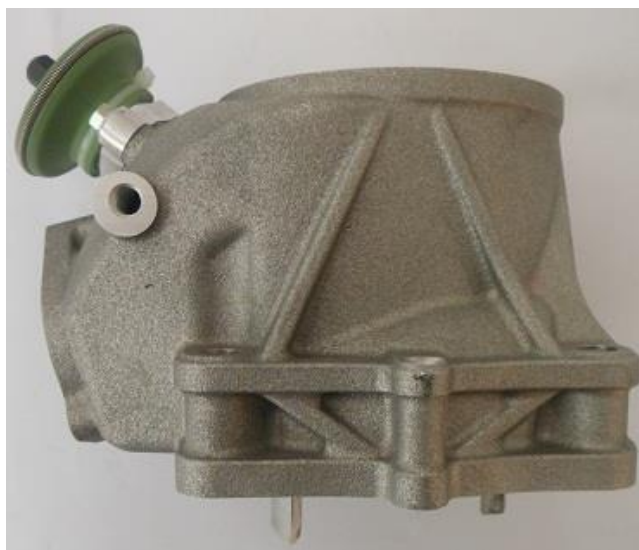
Photo of left-hand side of cylinder