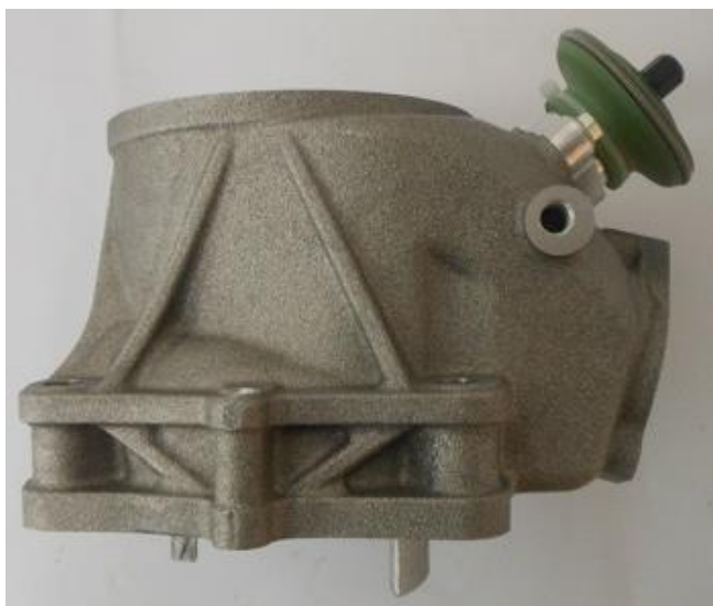
Photo of right-hand centre crankcase