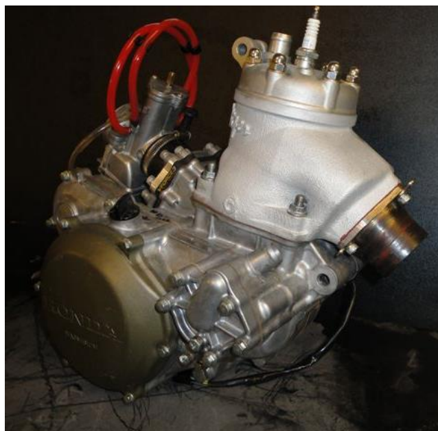
Photo of opposite side of engine