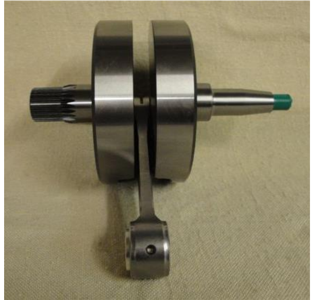
Photo of crankshaft