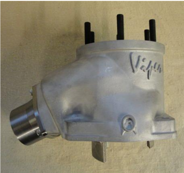
Photo of left-hand side of cylinder