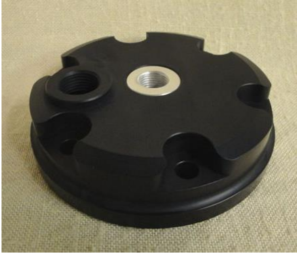
Photo of cylinder head