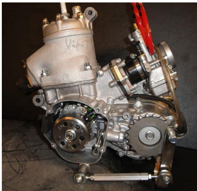
Photo of drive side of engine

This Registration Form reproduces descriptions, illustrations and dimensions of the engine at the moment of registration. This document may be supplemented by official amendment. This document must be read in conjunction with the appropriate Class Regulations.