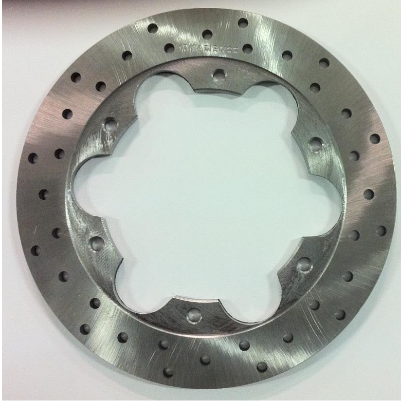
Photograph of brake disc