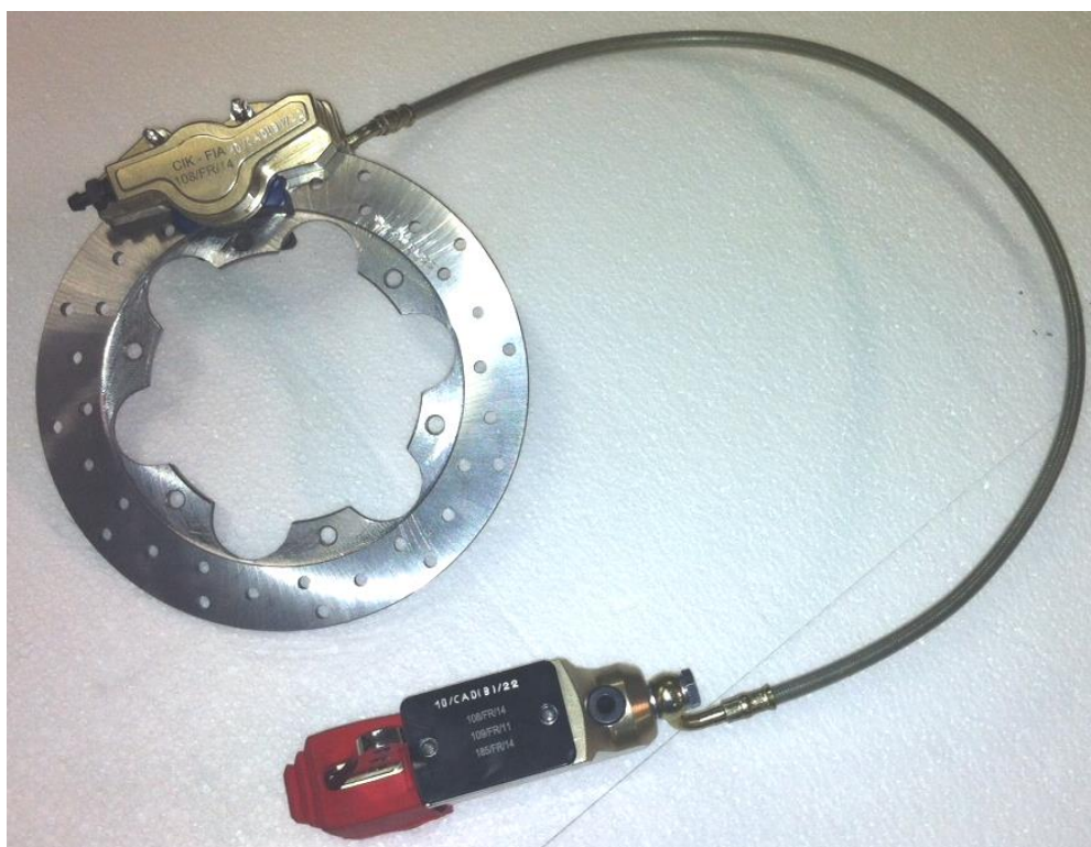
Photograph of the complete brake system

This Homologation Form reproduces descriptions, illustrations and dimensions of the brake system at the moment of the MSA homologation. The Manufacturer may modify them, but only within the limits set by the MSA Regulations in force and with the written agreement of the MSA.